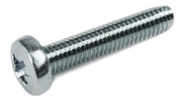
countersunk screw DIN 7985