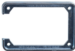
installation frame for door thickness >6 - 19,5 mm article No. 7-1-4010