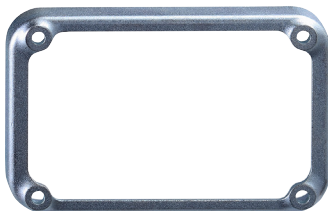
installation frame for door thickness 0,5 - 6 mm article No. 7-1-4009